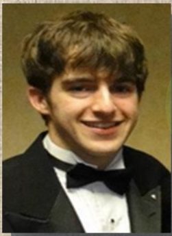
WEST VIRGINIA GOVERNOR