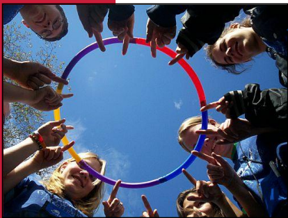
Article and Pictures: key-leader.org To see more go to: key-leader.org