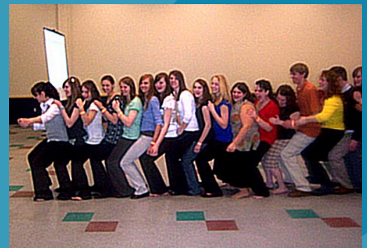
In pictures: members of the District Board